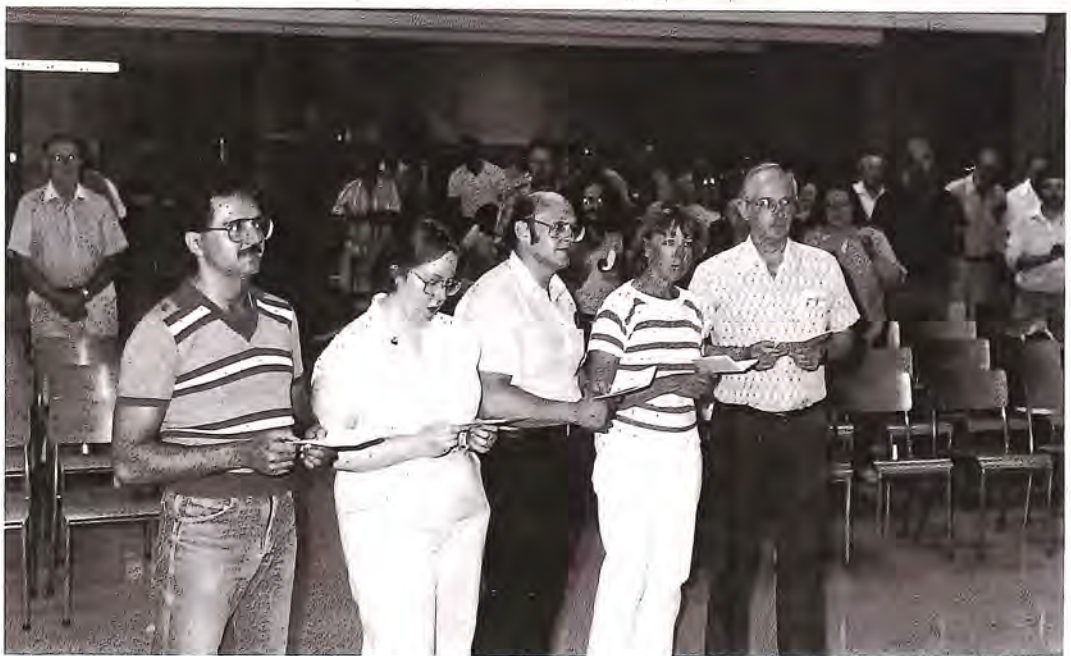
July 16, 1985 marked the official swearing in of HEU's first affiliate to the Vancouver and District Labour Council (VDLC), the St. Paul's unit.

British Columbia's 20 labor councils have some new faces in their ranks these days.