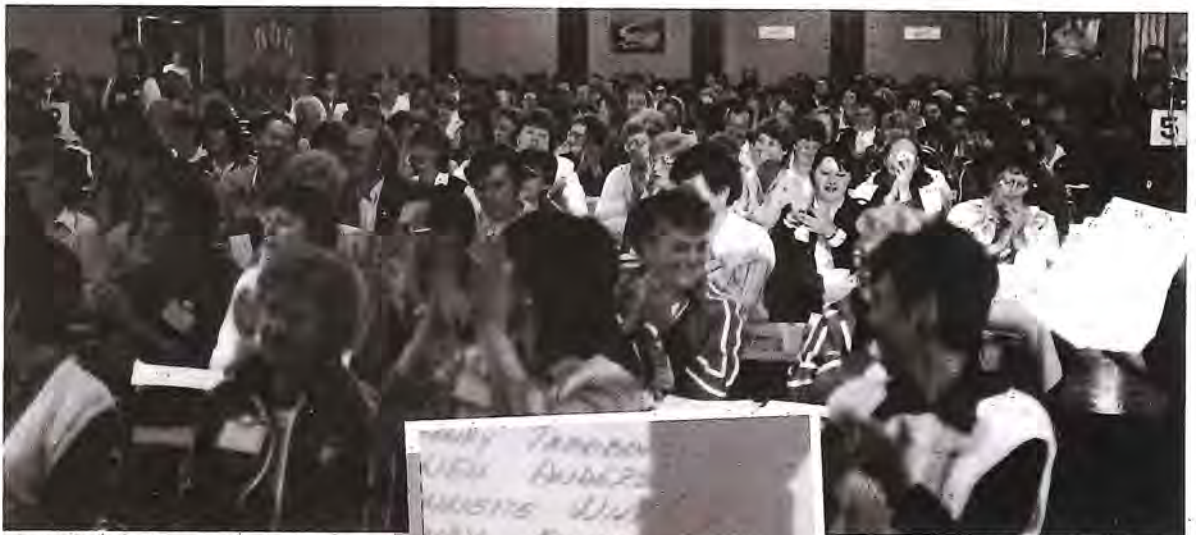
HEU's 14th Biennial Convention was held at The Richmond Inn from September 30 to October 3, 1984.

union's Fifteenth Biennial Convention must also be held in 1986 so a decision has been made by the Provincial Executive to hold both the convention and wage policy conference at the same time.