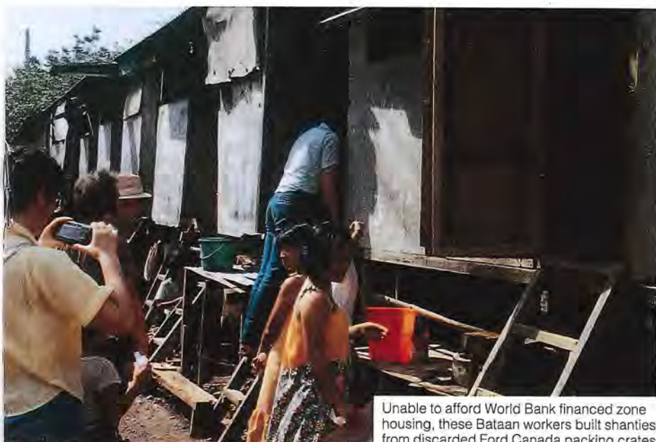
Unable to afford World Bank financed zone housing, these Bataan workers built shanties from discarded Ford Canada packing crates.