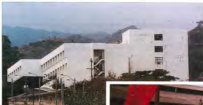
Modern export zone hospital is fully staffed but has no patients because workers cannot afford daily hospital charge.