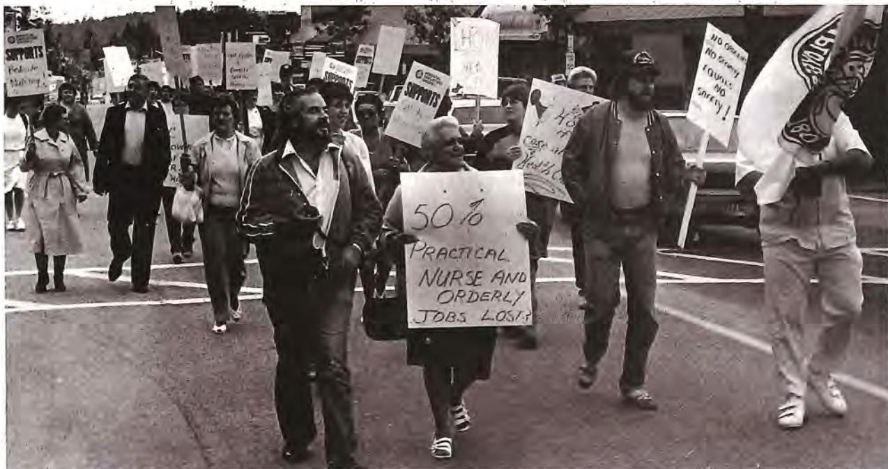
HEU members protest in Prince Rupert.

However, the hospital, represented by the Health Labor Relations Association, applied to the Labor Relations Board for an order to prevent HEU members from engaging in any work stoppages.