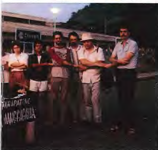
Workers at Chemark Plant in the Bataan Zone.

59 companies employing 30,000 workers in plants worth almost $3 billion. But today, only 42 companies are operating with a workforce of 14,000, predominately women.