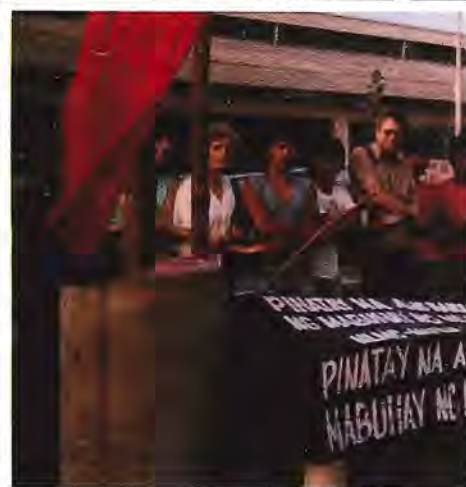
Canadian trade unionists link arms with