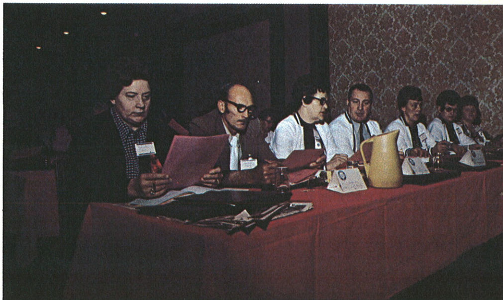
DELEGATES TO CONVENTION fix attention on speaker as resolution is read.