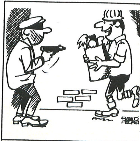
"Sorry, I just gave at the supermarket."