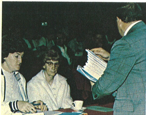
SECRETARY-BUSINESS MANAGER'S report is distributed.