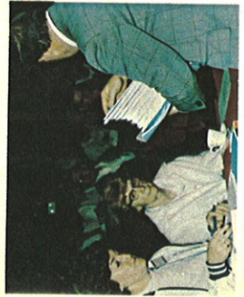
SECRETARY-BUSINESS MANAGER'S report is distributed.