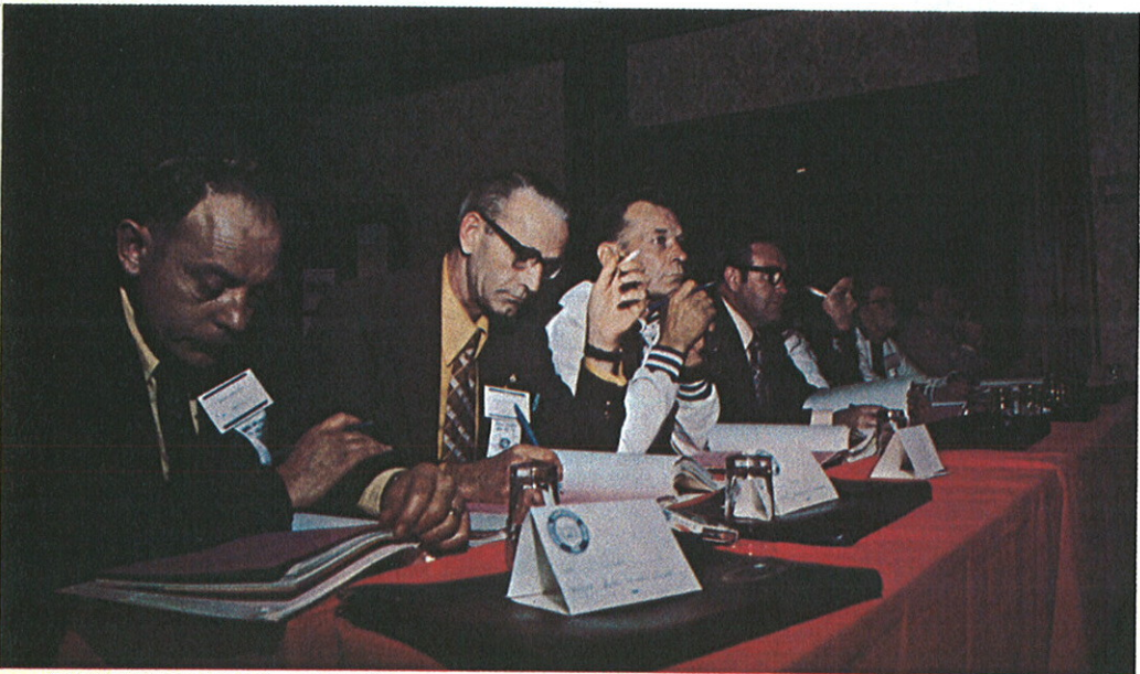
AMENDMENT TO CONSTITUTION is considered before break for lunch at Richmond Inn.