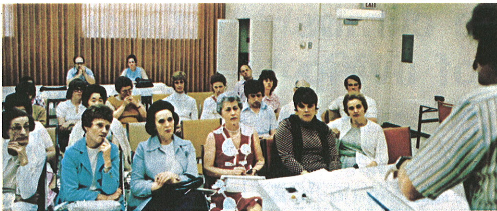
B.C. CANCER INSTITUTE employees are addressed by H.E.U. Representative.