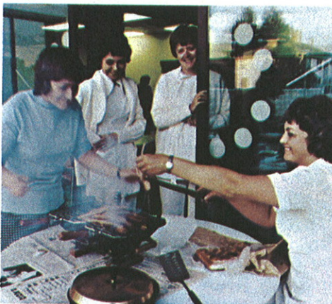
BREAKFAST at 6 a.m. for night shift.