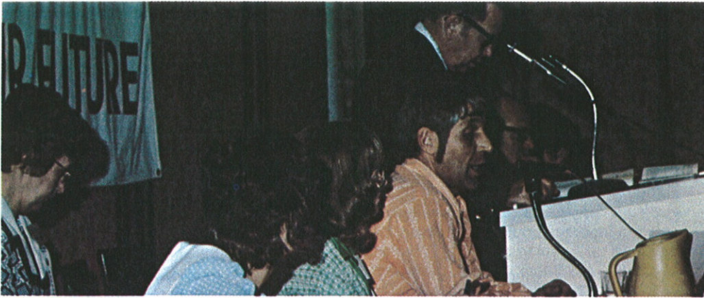
CONSTITUTIONAL AMENDMENTS COMMITTEE gives recommendations to membership.