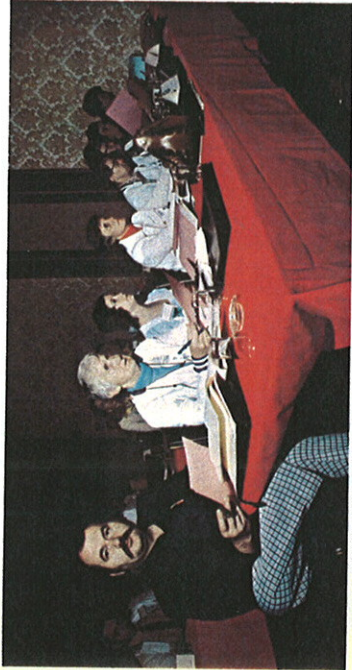
KOOTENAY DELEGATES consider views of speaker from the floor.