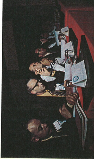
AMENDMENT TO CONSTITUTION is considered before break for lunch at Richmond Inn.