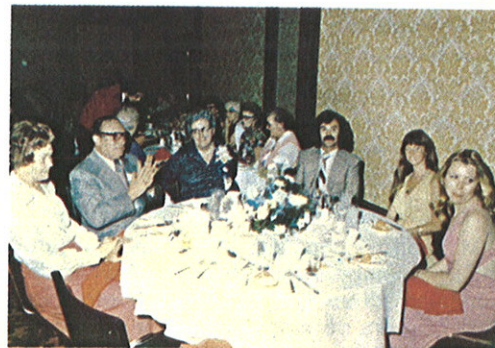
BANQUET NIGHT rounded off first day of Convention.