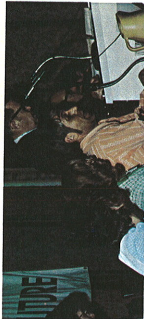
CONSTITUTIONAL AMENDMENTS COMMITTEE gives recommendations to membership.