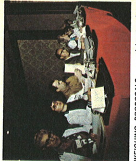
WEIGHING PROPOSALS... delegates from several units including Children's, Oliver, Pen-ticton.