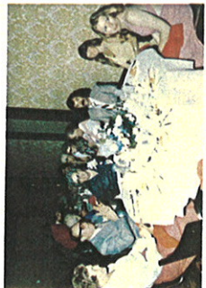
BANQUET NIGHT rounded off first day of Con-vention.