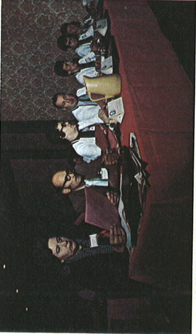
DELEGATES TO CONVENTION fix attention on speaker as resolution is read.