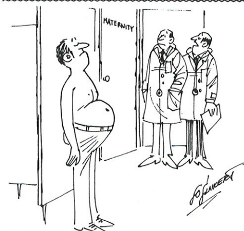
"No, it's no miracle, his wife is the president of the local woman's lib chapter."