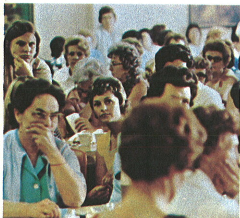
KELOWNA members consider decision.

"It is further understood that the above meeting will take place before July 19, 1974."