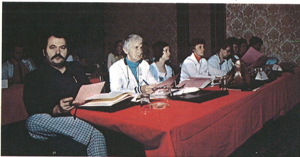
KOOTENAY DELEGATES consider views of speaker from the floor.