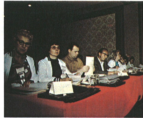
WEIGHING PROPOSALS . . . delegates from several units including Children's, Oliver, Pe-ticton.