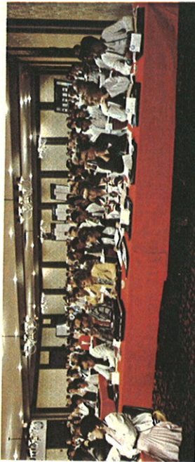
DELEGATES TO CONVENTION fix attention on speaker as resolution is read.