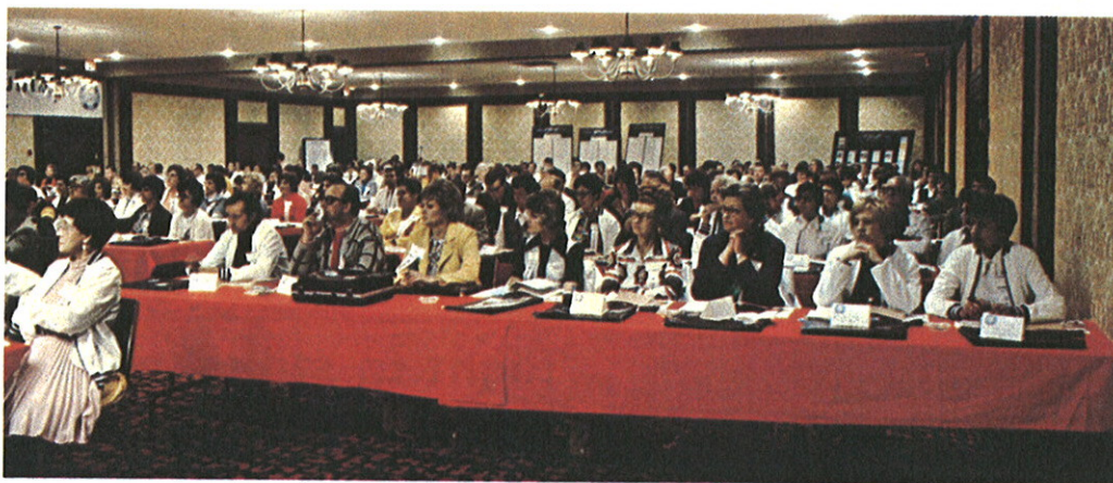
DELEGATES TO CONVENTION fix attention on speaker as resolution is read.