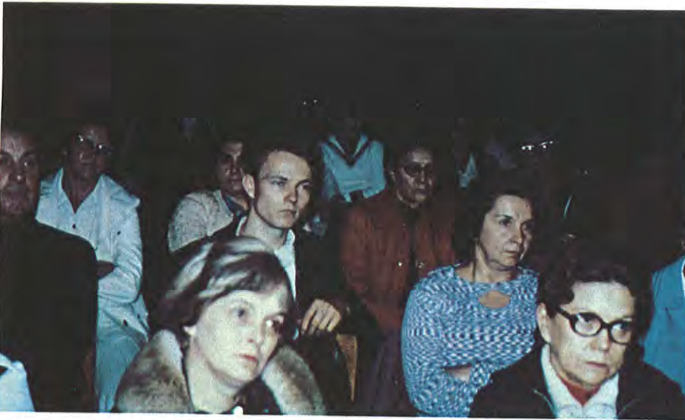
Cheer up. Attending a Trail Unit meeting can't really be that painful — can it? Just think, things could be worse. Someone could forget to put the coffee on.