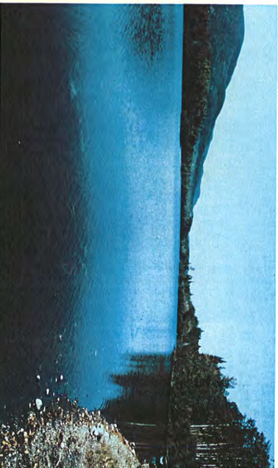
They are there — like so many gems strewn over a magnificent, uneven table — lakes of the North. Just part of the beauty that gives this vast country its beguiling charm. You can make your trip monetarily that up here, like elsewhere, there such thing as a scenic route. In fact, the growing number of units in the North. Of course, one cannot deny beauty of places like Babine Lake. One would not want to.

The same campaign is being repeated elsewhere with marked success, particularly in the North. Probably the best indication of how things are going is this: since the accompanying article on servicing was written, the list of the organized has increased considerably to include 100 Mile House, Fort St. James and Burns Lake Hospitals, and the Practical Nurses and Clerical Workers at Grace Hospital in Vancouver.