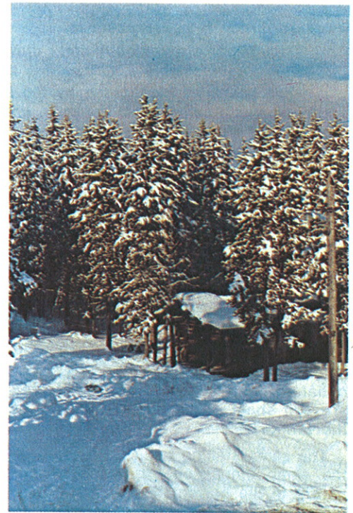
They worked in Christmas card setting.