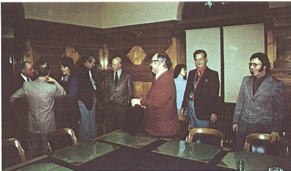
Meeting to deal with Union's drive for better training drew large number of participants. Some mingled here during break in session, which was held in main Legislative Building.

It was left with the Union and B.C.H.A. to try and introduce the program through collective bargaining. The cost would lie with the Health Department, curriculum with the Education Department, and the Labor Department would be responsible for the welfare of those enrolled.