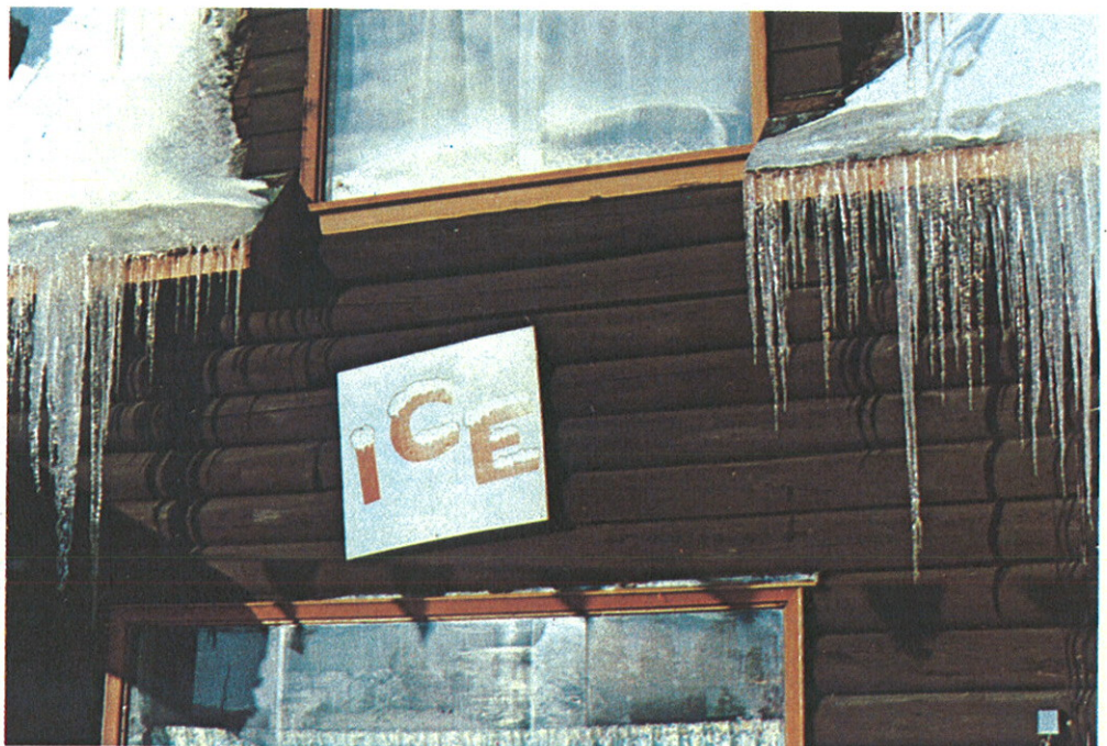
Is this sign really necessary? It brought a chuckle of relief to busy day of organizers.